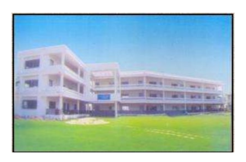
Submitted by R C Patel College of Education Shirpur Dist Dhule